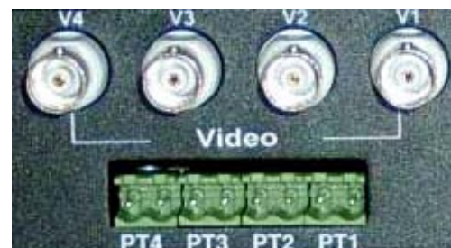
The BNC video input and PT controller connectors

Live full-color streaming video is available at up to 30 fps (320 x 240 resolution) via the web interface, and up to 50 streams of video can be accessed simultaneously. Standard JPG format pictures are used, allowing the use of third party host tools to store and analyze the JPG pictures. All pictures are in the Standard JPG format and the Standard CIF picture size is 352 x 288 pixels or VGA (640 x 480). The pictures can be easily downloaded from the securityProbe into a local host.